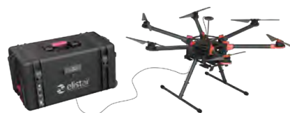
Tethered drone with the Elistair Safe-T station

Elistair provides tethered drone solutions offering continuous and real-time aerial video fully adapted for road traffic monitoring. As Lyon's suburb concentrates much of the road traffic, Elistair conducted during rush-hour time road traffic measurement sessions located at a busy roundabout employing a civilian drone attached to the Safe-T tethered station.