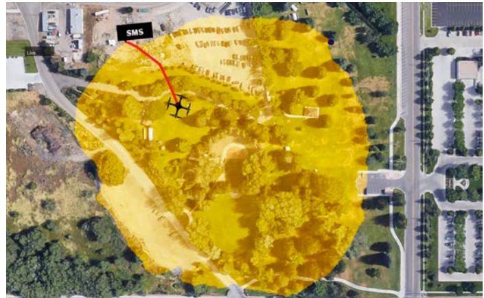
Tracking information and SMS notification.